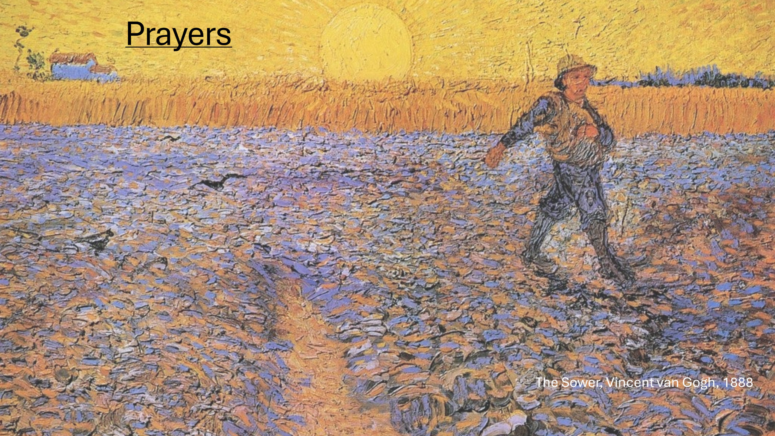
The Sower, Vincent van Gogh, 1888