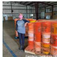
Presbyterian Church of the Cross