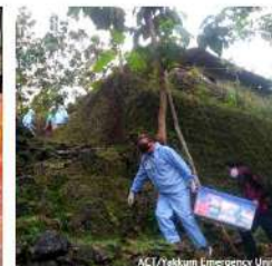
ACT/Yakkam Emergency Unit