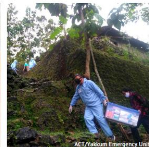
ACT/Yakkum Emergency Unit