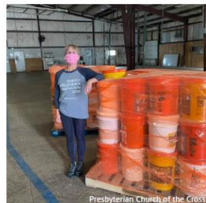
Presbyterian Church of the Cross